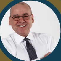
NIGEL GIFFORD OBE